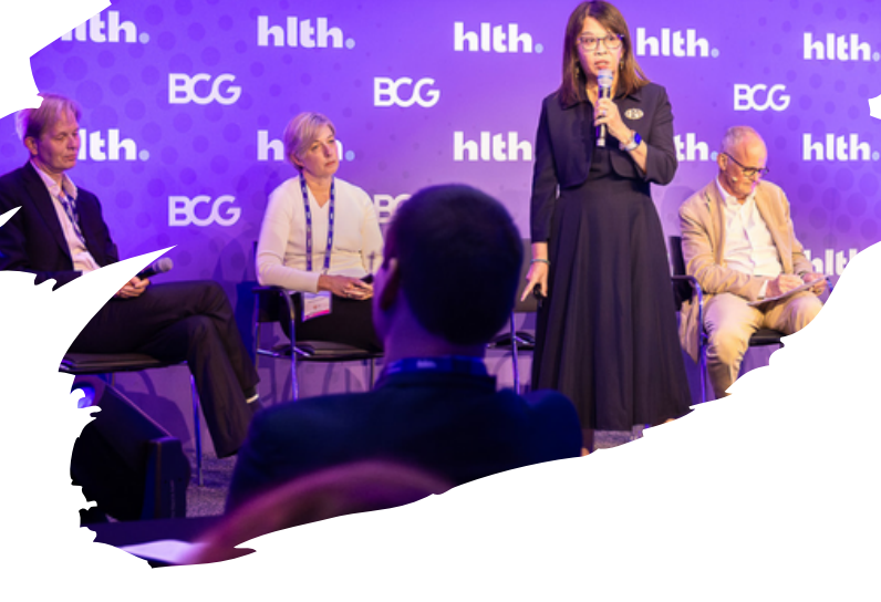
26 Countries represented