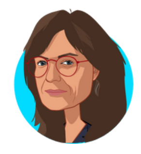
Head of Unit 'Digital Health' European Commission