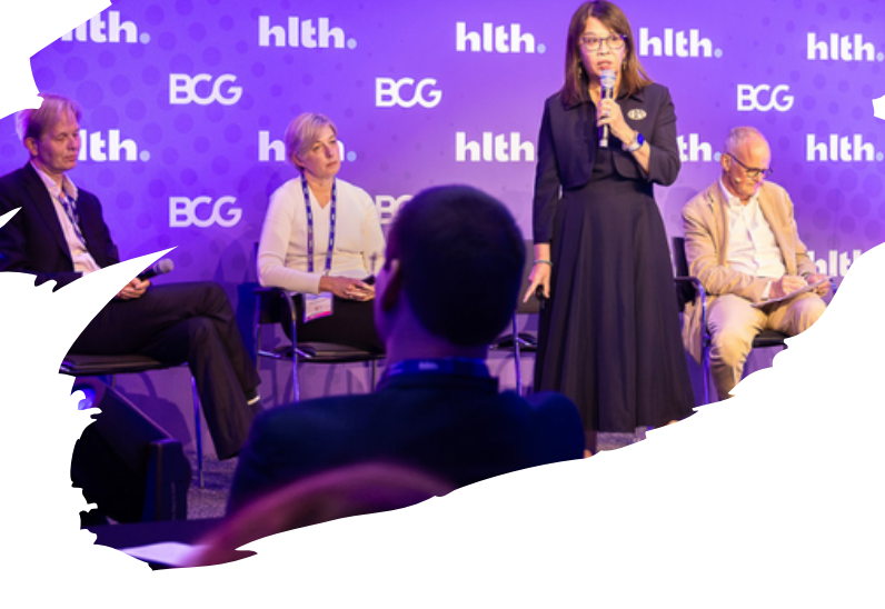
26 Countries represented